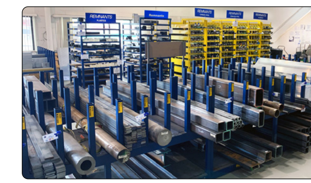
Browse through our large selection of easily identifiable metal and plastic bar stock