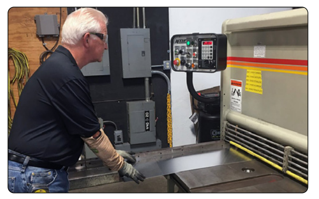
On-site shearing is available as well