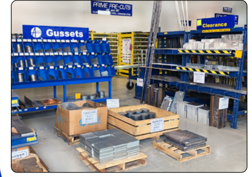
Our Alro Metals Outlets are your one-stop shop for all your metals and plastics needs!