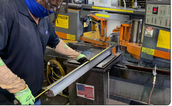
We offer cut-to-size saw cutting